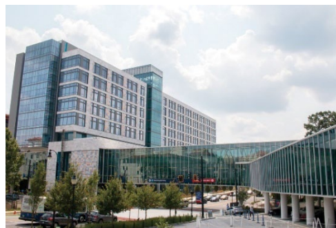
Emory University Hospital Atlanta, GA

Emory Healthcare (EHC) is an integrated academic health care system committed to providing the best care for patients, educating health professionals, and shaping leaders for the future. As the most comprehensive health system in Georgia, Emory offers patients and families the choice of more than 3,700 doctors and 525 locations including 11 hospital campuses as well as primary care, urgent care, and MinuteClinics across Atlanta and beyond.