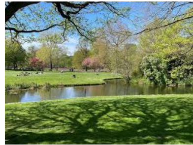
Creasey Bicentennial Park Grand Blanc, MI

Grand Blanc Township, incorporated in 1833, is viewed as a premier community boasting a rich history and humble beginnings. The community, located in gently rolling hills, has an innovative approach to development. It has top-rated public, parochial and private schools, providing incentives and opportunities for educational achievement, distinctive subdivisions and home sites plus quality apartments, townhouses and condominiums.