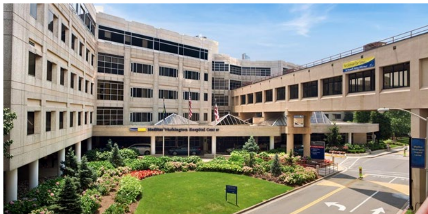
MedStar Washington Hospital Center, Washington D.C.